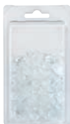
POLYPHOSPHATE CRYSTALS 6/10 (small) 160 g blister, refill TO DOSAL.